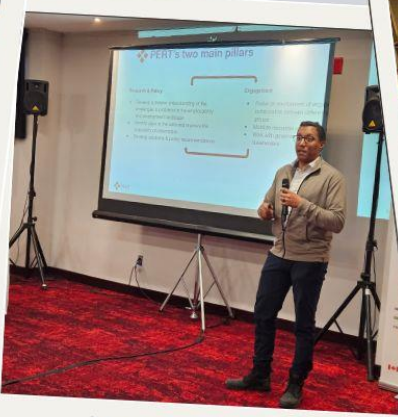
Youth Network Forum