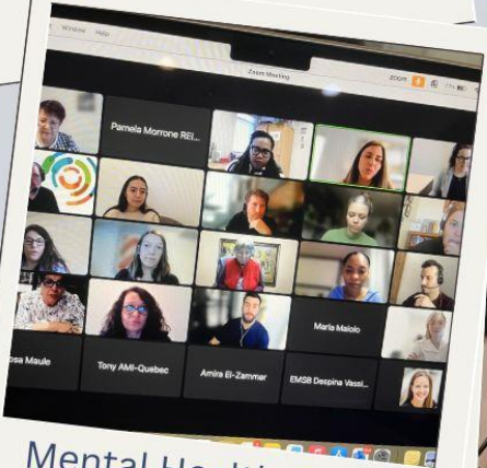
Mental Health Forum