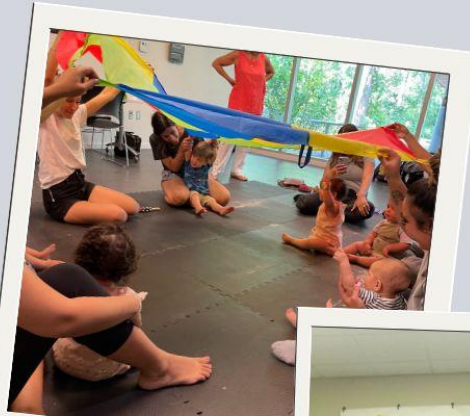
Sensory play workshops