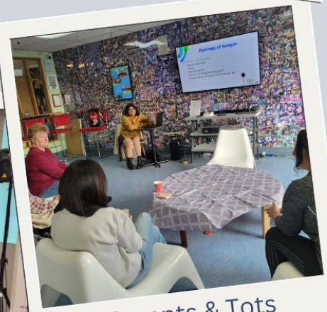
Parents & Tots Workshop