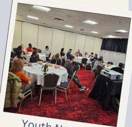
Youth Network Forum