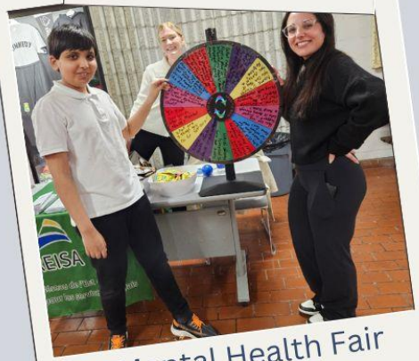
Mental Health Fair