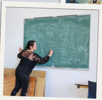
Lunch & Learn