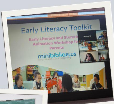
Early Literacy Workshop