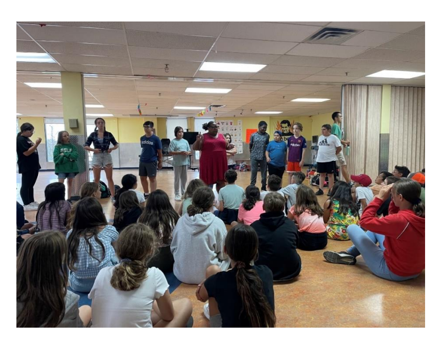
Improv Against Bullying at the Don Bosco Youth Leadership Center