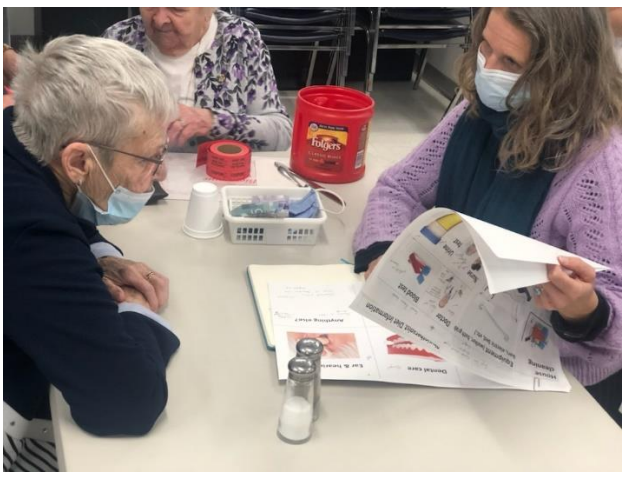
Seniors Focus Group at Almage Senior Center