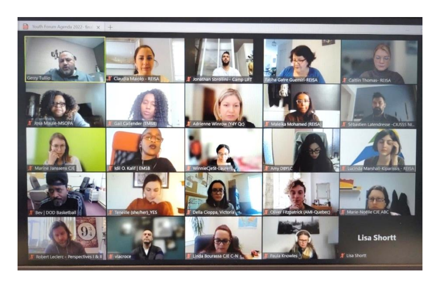
Annual Youth Forum