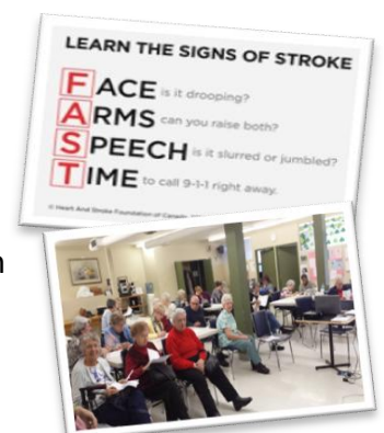
Photo: CHEP DVD Session at Almage Seniors Centre