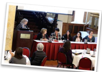
Photo: REISA panel discussion