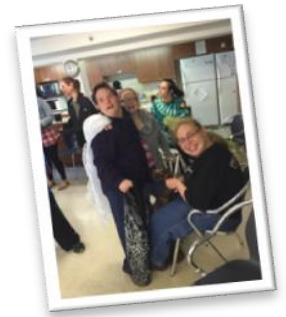
Photo: Young adults at CDH

Parents and caregivers of children and young adults with special needs participated in 2 focus groups at the Centre of Dreams and Hopes (CDH) to discuss the barriers and challenges that they and their families continue to endure in regards to the lack of adequate services and support for English-speaking individuals and families with special needs. A report on the findings will be presented to the 2 CIUSSS'.