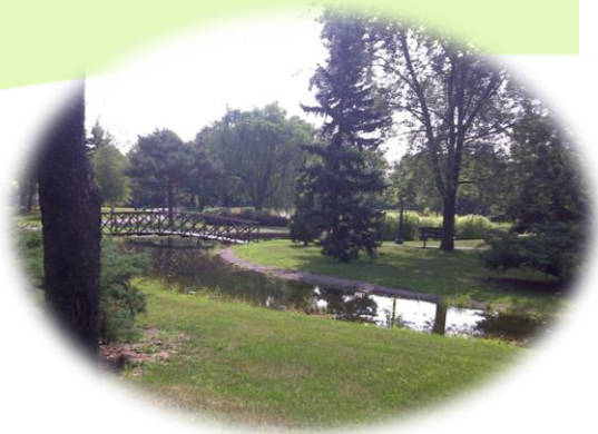
Photo: Wilfrid-Bastien Park