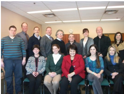
Members of the CHSSN and the Montreal-Laval-South Shore Community Network Table meet in the East Island on January 23 rd 2013.