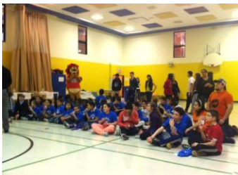
Health fair uniting children from a French-speaking and an English-speaking elementary school.