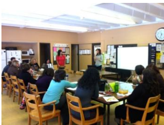
McGill Dietetics Intern presenting a workshop on healthy snacks at Gerald McShane Elementary School.